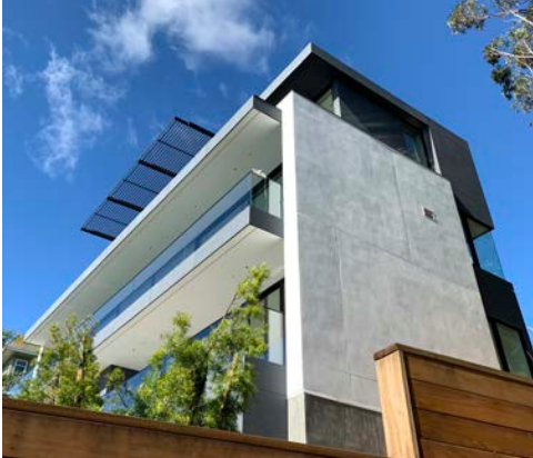
GLEN PARK RESIDENCE, UNDER CONSTRUCTION