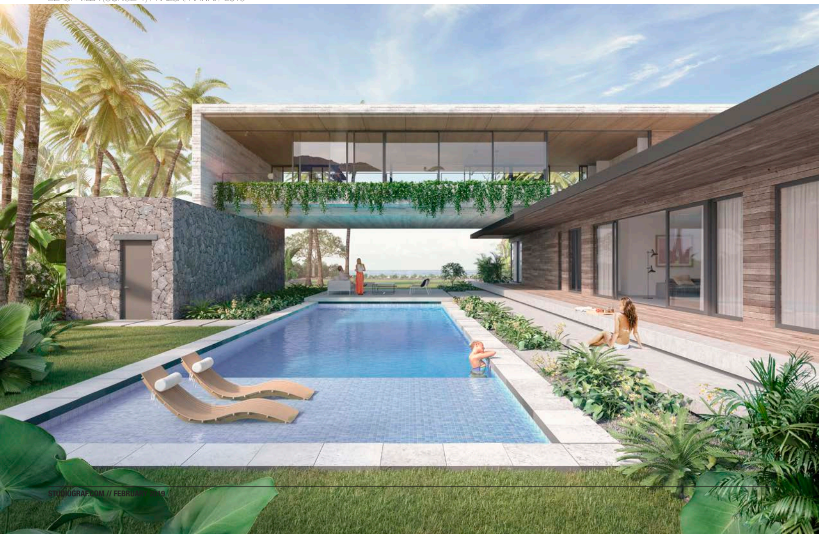
BEACH VILLA (CONCEPT) / KAILUA, HAWAII / 2019