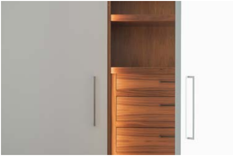
RUSSIAN HILL APARTMENT