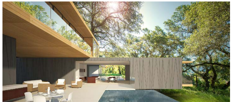
ONE BENNETT VISTA PLACE

THE LAUNDRY // San Francisco, CA // 2014-2017 [design development & permits] Vertical extension of a historic two level brick building in the Mission District. Eight new residential units over 4 additional floors and a retrofit of 5,500sf of commercial space into an art gallery with cafe.